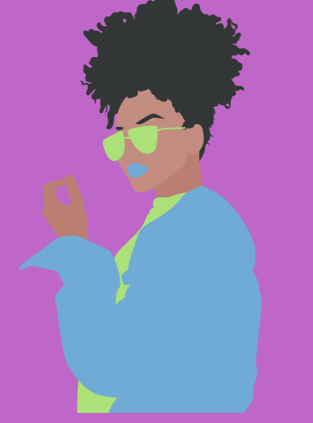
You have the right to know your rights