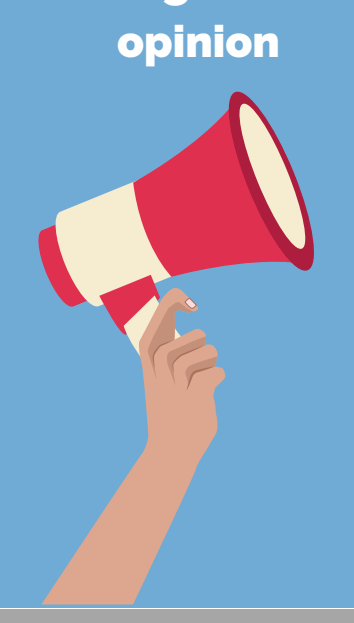
The right to an opinion