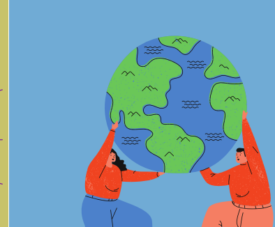
protection and freedom from