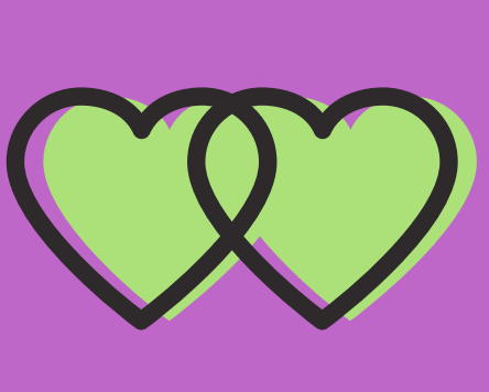
Special education and care if you have a disability