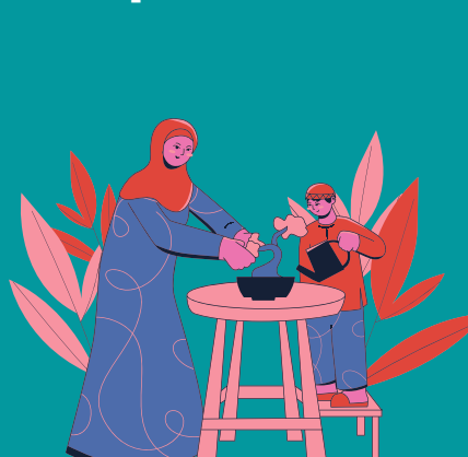
Right to be raised by your parents (if possible)