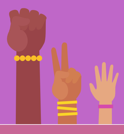
An identity that nobody should take away from you