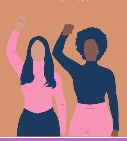
To set up groups and choose your friends