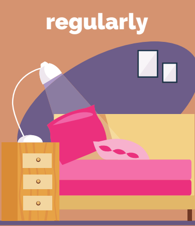
If you are in care, your living space should be checked regularly