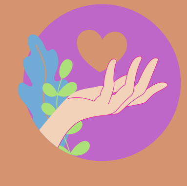
Nobody is allowed to kidnap or sell you