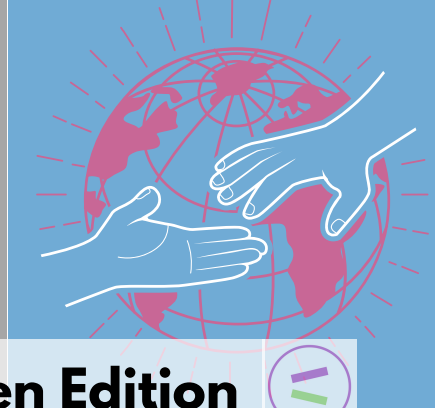
Laws from the country you reside protect you