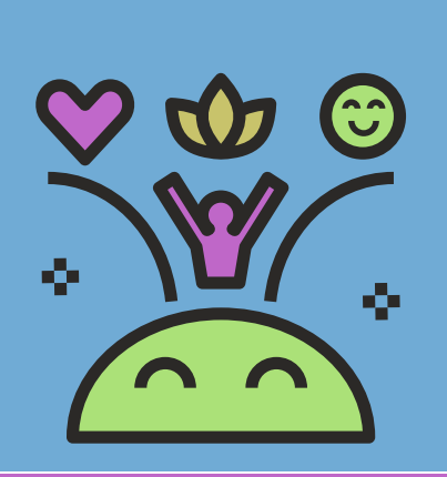
A right to the things that will keep you safe, clean and well