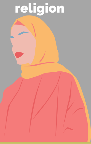
Practice your own culture, language and religion