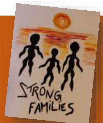
One of the t-shirt designs created as part of the Clothesline Project.

The International Clothesline Project is a visual display of t-shirts designed by women survivors, with messages and illustrations to increase awareness of the impact of family and domestic violence against women and children. Here at Starick, the Clothesline Project is run on a monthly basis and the t-shirts help celebrate women's strength and courage to overcome the past. Clients at this creative workshop are encouraged to design their own t-shirts in a relaxed, supported environment.